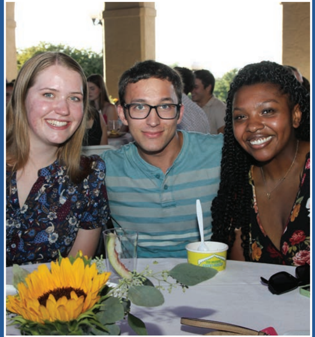
On Aug. 31, students attended the annual Welcome Picnic to celebrate the new academic year.