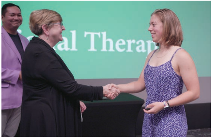
On Aug. 25, we held our annual Convocation and Pinning Ceremony to formally welcome our MSOT '25 and OTD '26 students to the profession.