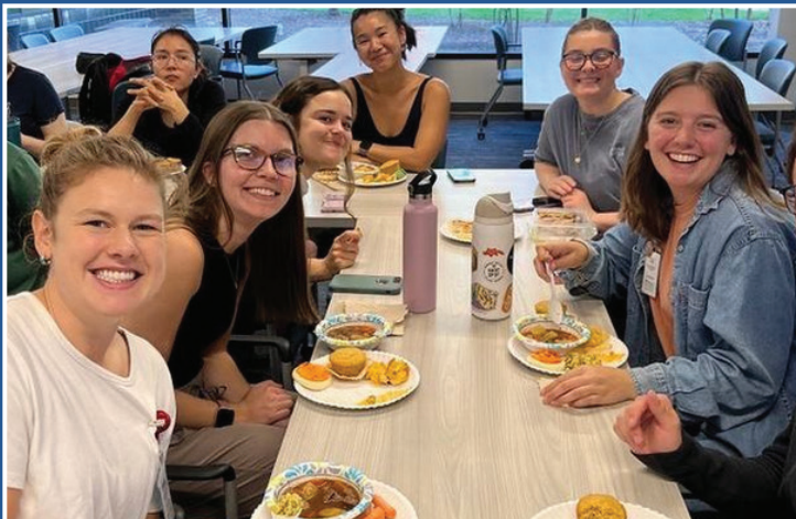
On Nov. 6, WashU's Coalition of Occupational Therapy Advocates for Diversity chapter hosted a potluck lunch to support Northside Youth and Senior Service Center.